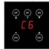
Remote Wall Mount Control Panel